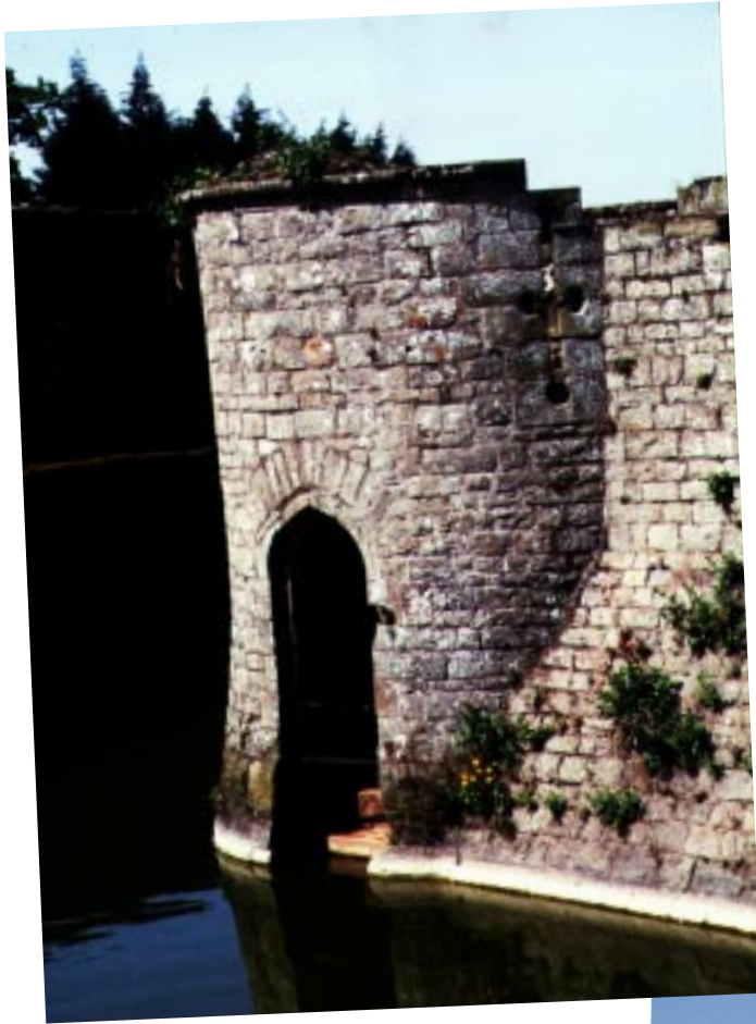
A gatehouse, guarding the moat