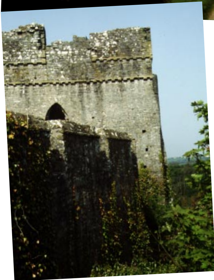
Another once well-built castle/fortress in disrepair, particularly the living quarters, since they were typically a little less robust than the fortifications.