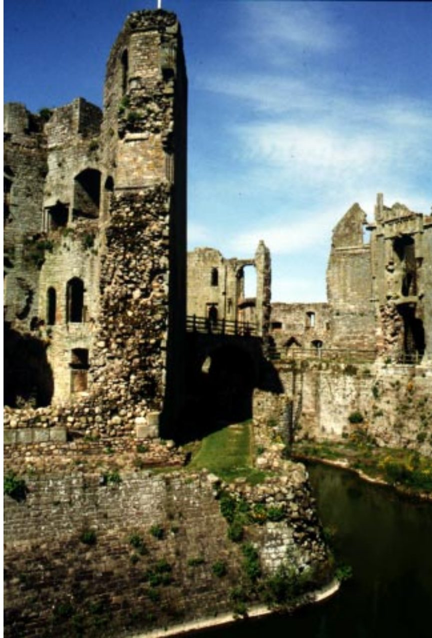
The walls, in an advanced state of disrepair appear to have been about two meters thick.