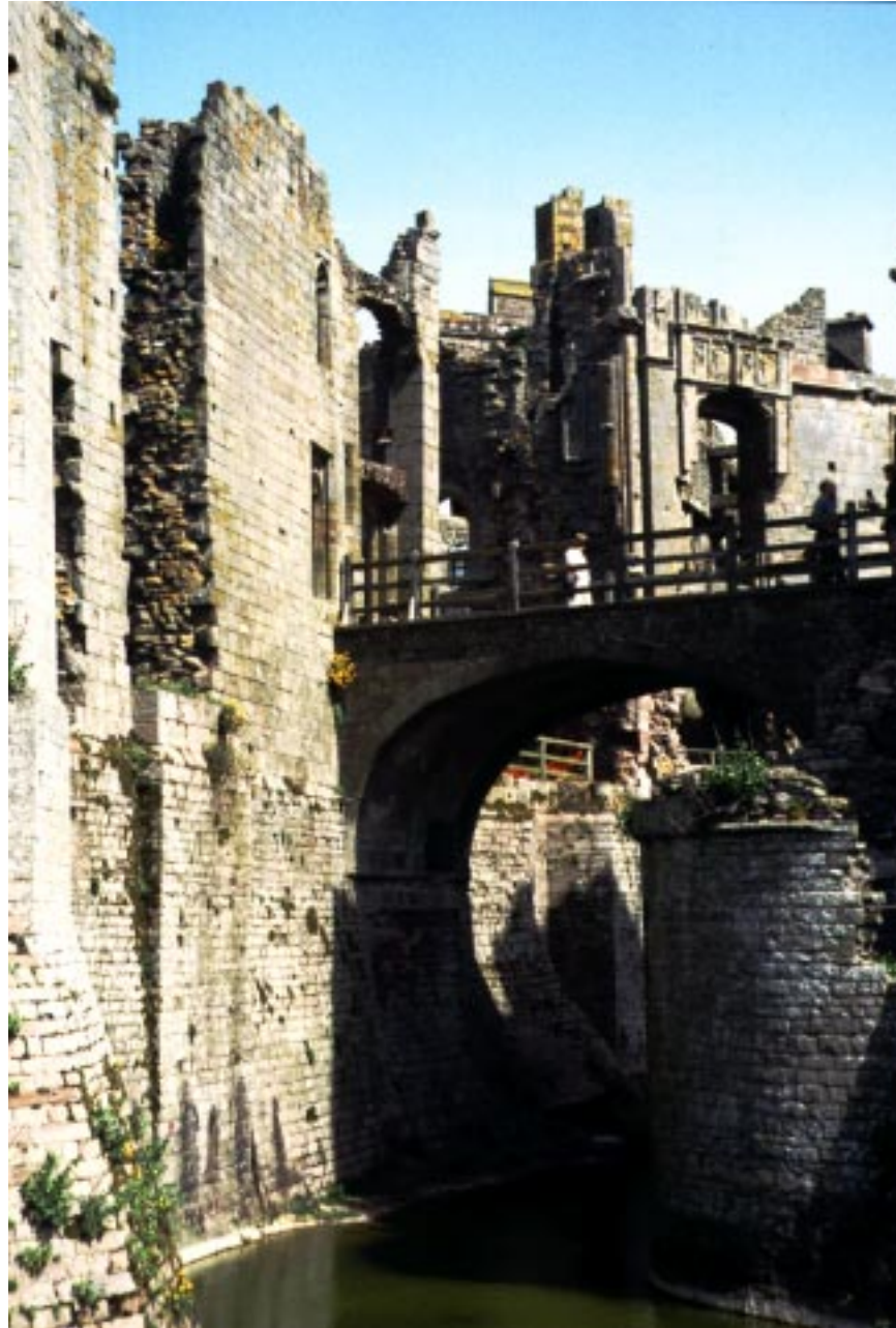
The moat from another viewpoint