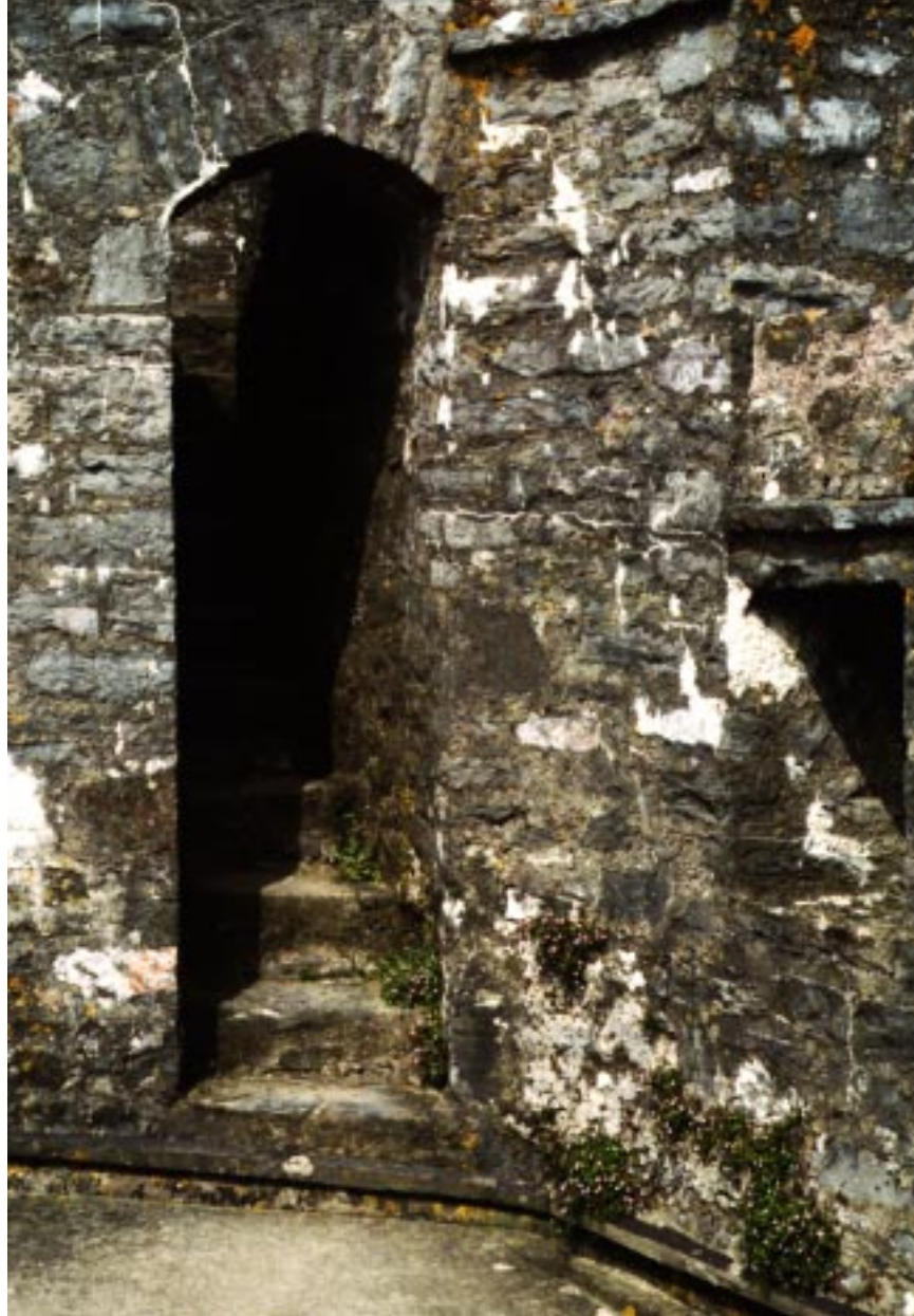
Stairway leading to a guard tower