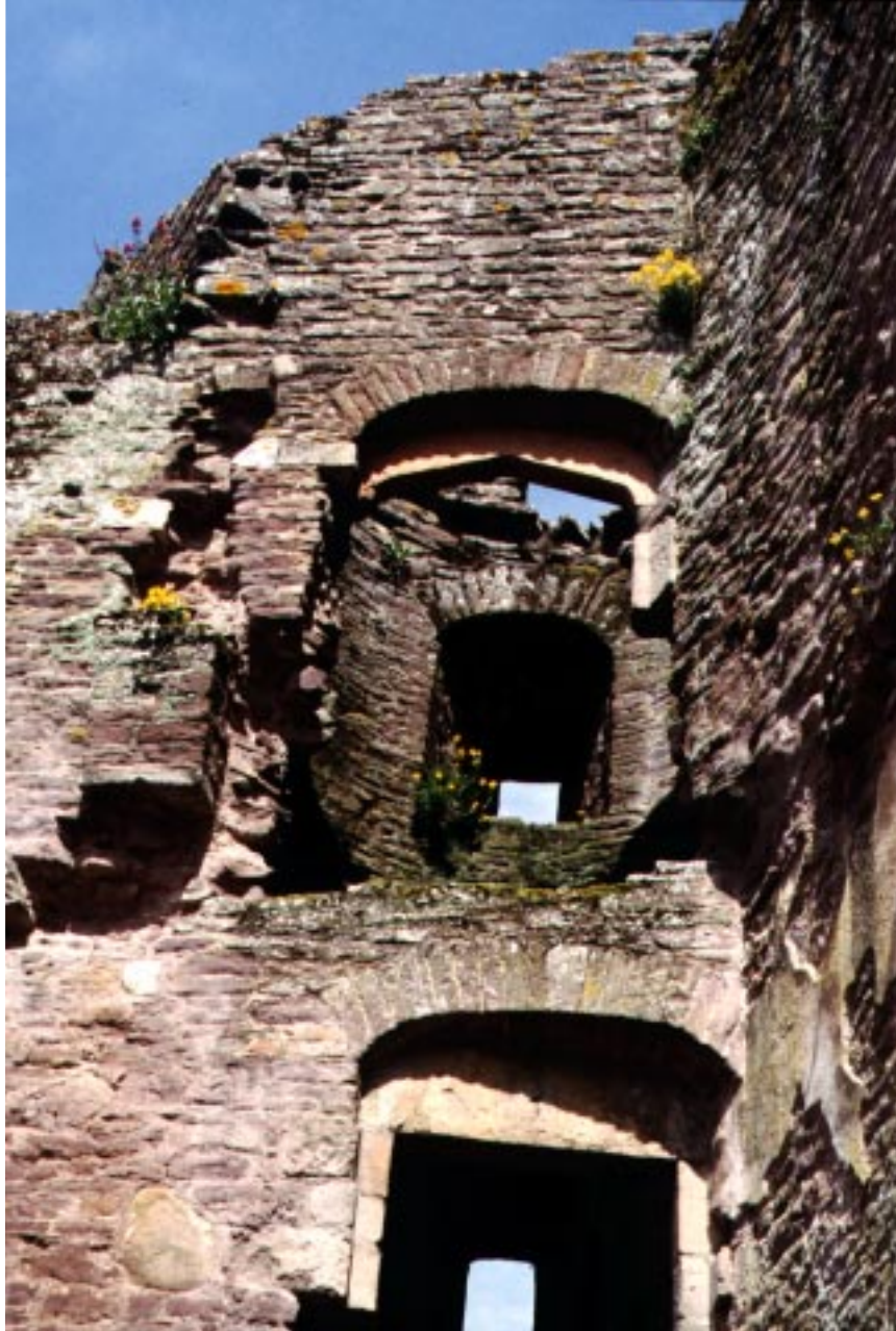
View from inside what was once the great hall