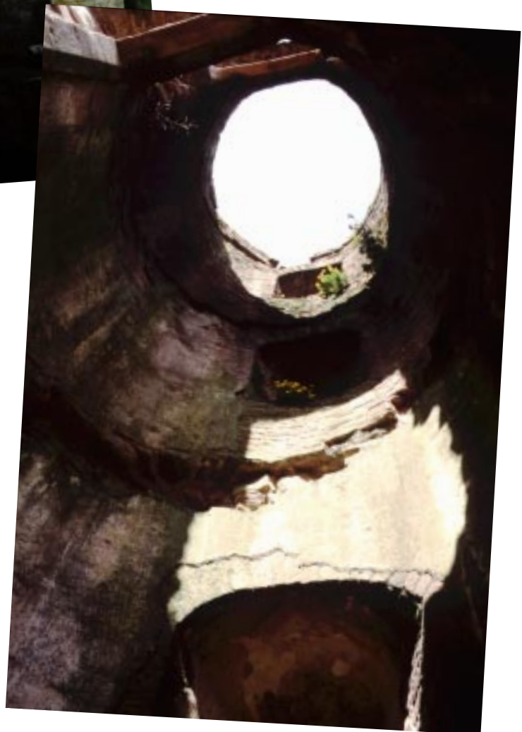
View up the keep ~ notice the outline of the floors it once used to have.