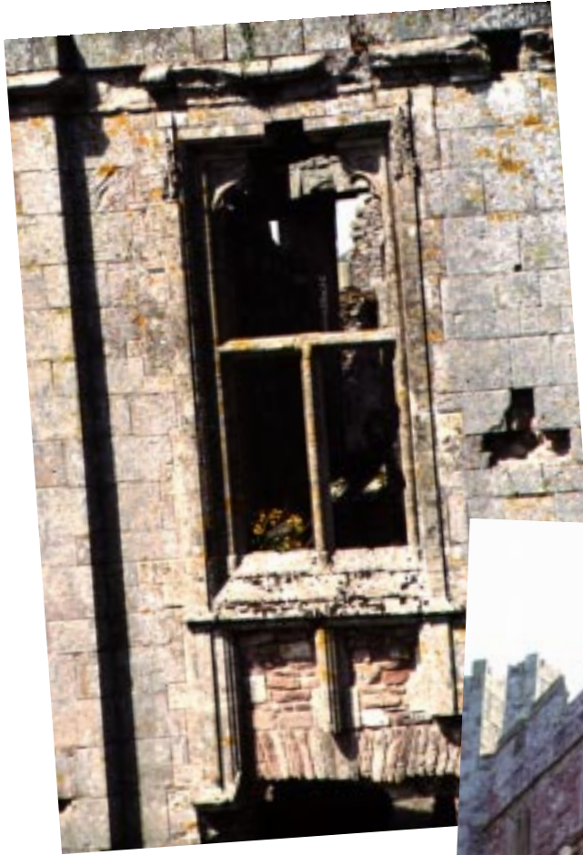
View from an inner courtyard